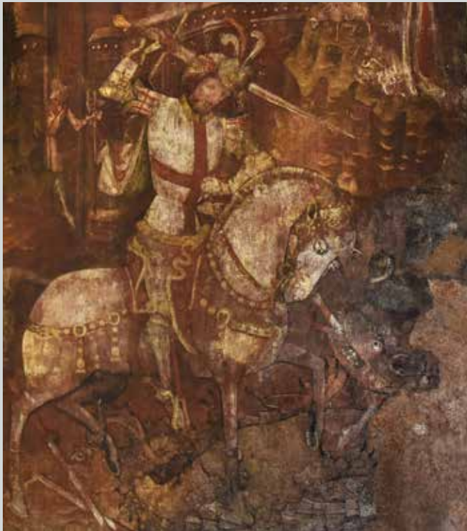
Image: St Gregory

Norwich is a City of Churches. It has a collection of 31 medieval churches, reputedly more than any other city north of the Alps, memorials in flint and stone to its rich heritage and former position as the second city in the kingdom. In the High Middle Ages (from about 1200 to c.1550) Norwich was also a very religious city. It has been described as Europe's most religious city during the period with a tradition of anchorites and hermits and a number of informal (and fairly transient) groups of women living together in chastity - in all likelihood influenced by the béguinages (establishments housing members of a lay sisterhood) of the Low Countries.