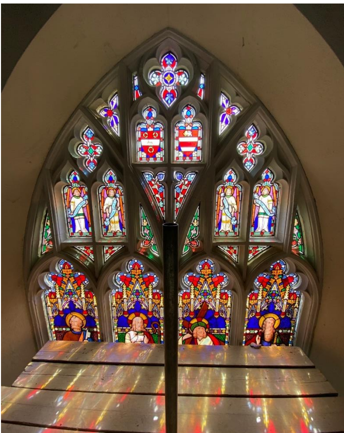
Section of window during installation